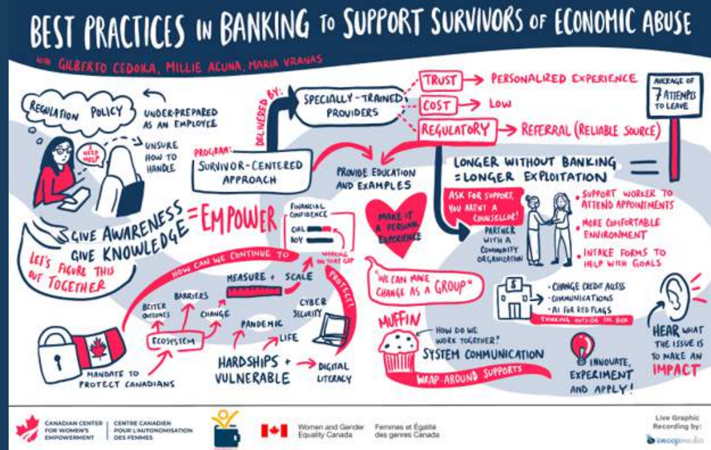
[graphic recording by Laura Hanek]

The final panel solidified key learnings and highlighted Canada's macro- and systems-level trends. The speakers offered participants a view of Canada's avenues for change from a banking, policy, and frontline perspective and inspired tangible next steps.